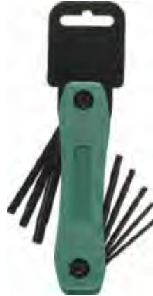
No. 140-626 (6-Lobe) 8 Keys