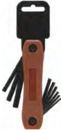
No. 140-515 (Inch) 9 Keys