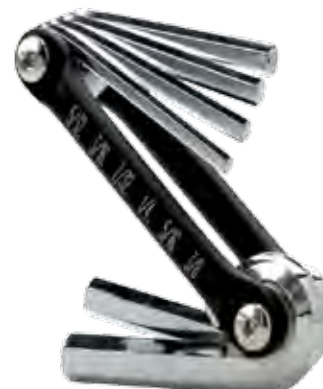
No. 140-521 (Inch) 6 Keys