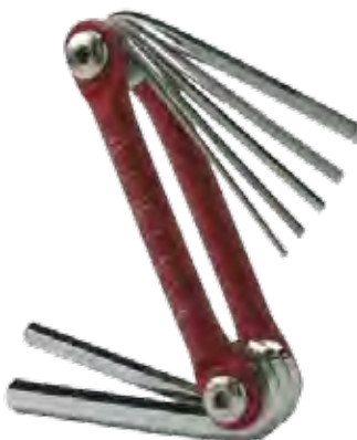
No. 140-620 (Metric) 7 Keys