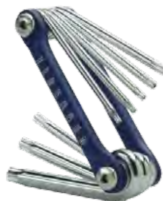
No. 140-625 (6-Lobe Security) 8 Keys