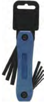
No. 140-615 (Metric) 8 Keys