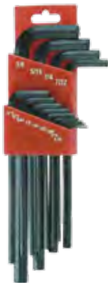
No. 140-530 (Inch) 13 Keys

*Socket Key Merchandiser P.O.P. Display #022-015 see page 124.