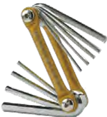
No. 140-520 (Inch) 9 Keys