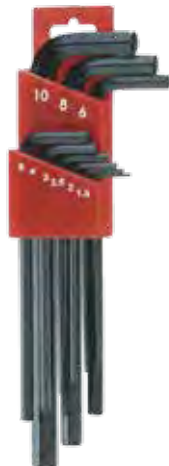
No. 140-630 (Metric) 9 Keys